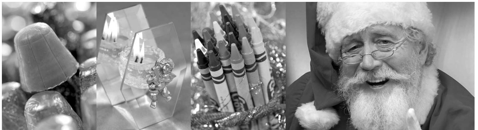
FREE treats at Santa's arrival!